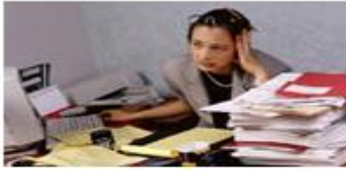
Student Centered Learning Dilemma