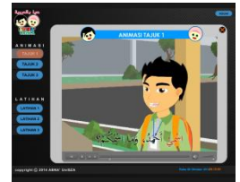
The approach of 'seeing, hearing and imitating'