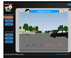
Subtitles in Arabic language